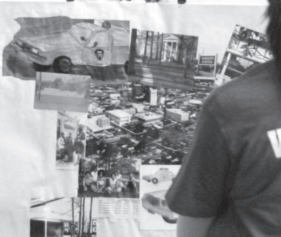
A VOLUNTEER VIEWS DISPLAYS AT A PUBLIC HEARING.