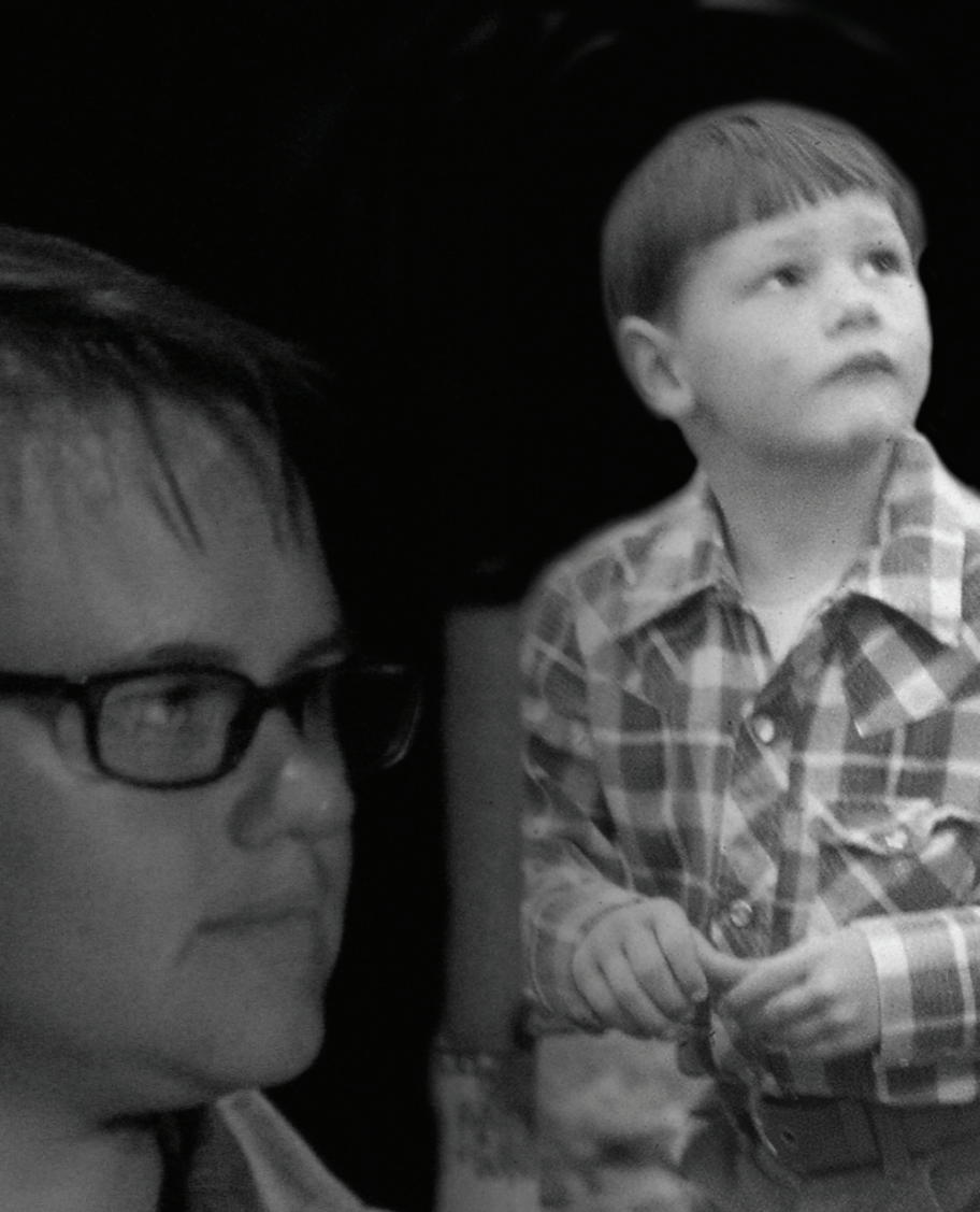
CHILDREN OF PEOPLE INVOLVED IN THE EVENTS OF NOV. 3, 1979.